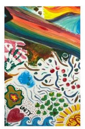
Artwork by H&F young people

Join online at joinunison.org or call free on 0800 171 2193