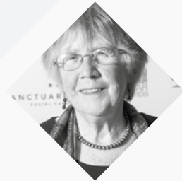
June Thoburn Outstanding Contribution to Social Work Award Winner 2016