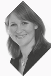
Judy Cooper Community Care